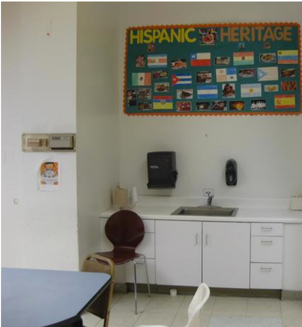
Martha's Table handwashing station BEFORE updates.