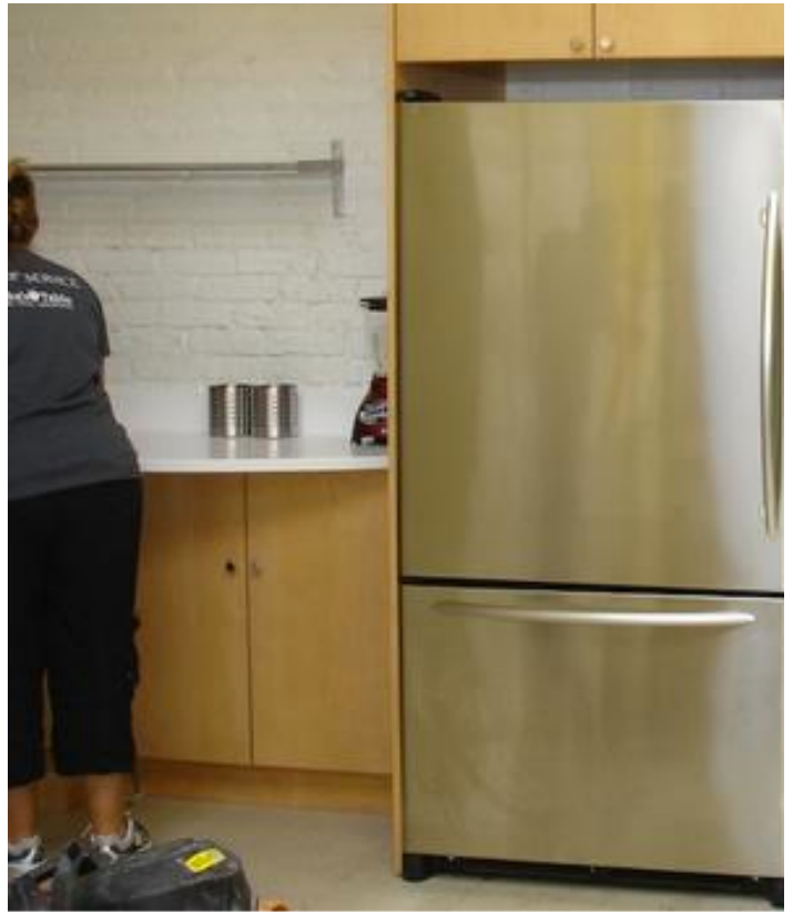
Martha's Table kitchenette AFTER Aidan Design's renovations