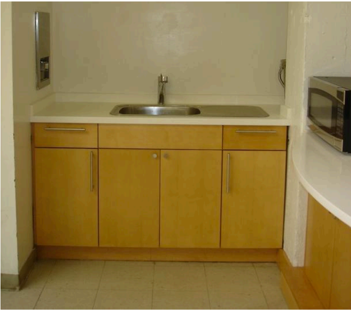
Martha's Table sink in kitchenette AFTER Aidan Design renovations.