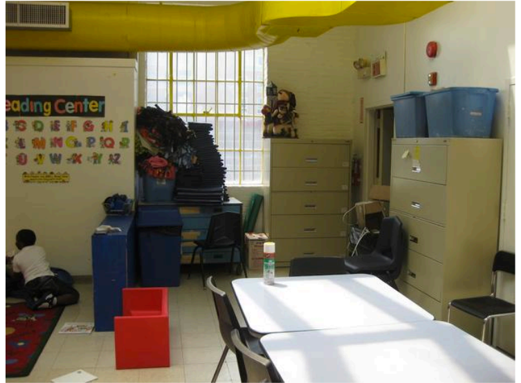
Martha's Table art/reading center BEFORE updates.