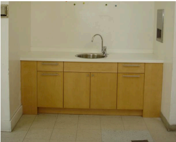
Martha's Table handwashing station AFTER Aidan Design's renovations.