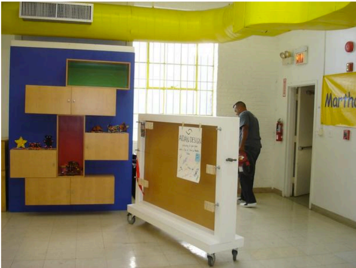
Martha's Table art center and display board AFTER Aidan Design's renovations.