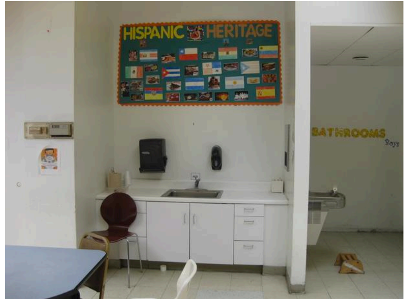
Martha's Table handwashing station BEFORE updates.